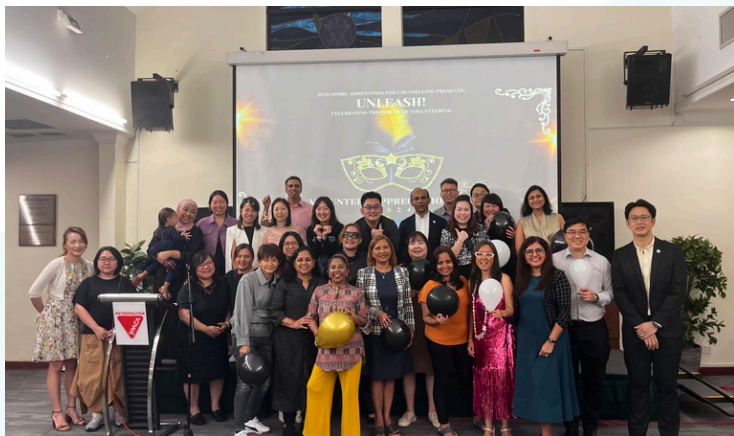
Volunteers Appreciation 2024

We had break-out groups for private and community counsellors (FAM, Schools, etc.) on the theme on Connected Care. The milestone highlights for new MSC members were volunteer opportunities to serve in registration and logistics support at SAC Annual General Meeting (AGM) 2024 and Volunteers Appreciation 2024 at Metropolitan YMCA and the SAC Counselling and Psychotherapy Symposium 2024 at YWCA Fort Canning in April, November and December. Not forgetting, our year-end MSC Retreat 2024 to appreciate the sacrificial involvement of members in diverse capacities.