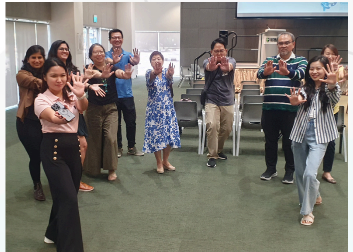
New Members' Orientation 2024

The SAC Membership Sub-Committee (MSC) commenced 2024 with a series of interest group sessions to engage SAC members. There were double runs of Self-Care Mindfulness practice session to about forty (40) attendees in January and March. The Assisi Hospice Learning Journey workshop had twenty five (25) attendees gained insights of palliative care work and had an on-site Hospice tour. About another twenty (20) attendees signed up for the Self Care Experiential workshop in June. Close to thirty (30) new members signed up for our annual SAC New Members Orientation at Republic Polytechnic in August.