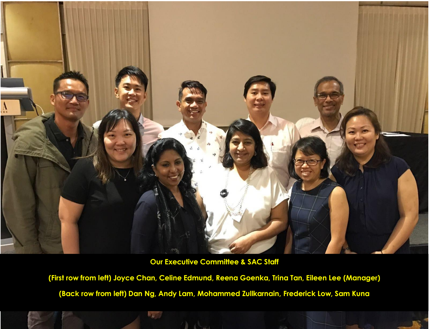
Our Executive Committee & SAC Staff